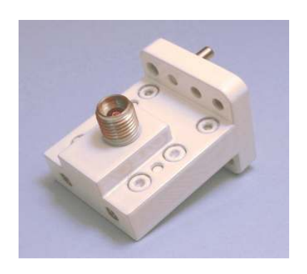
Main View A plastic cover (not shown) is provided to protect the connector