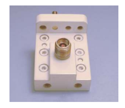
Mounting Holes M3 x 4 mm deep